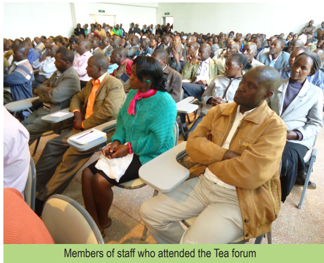
Members of staff who attended the Tea forum

praised staff for positive performance. The forum ended on a positive note with the staff satisfied with the outcome.