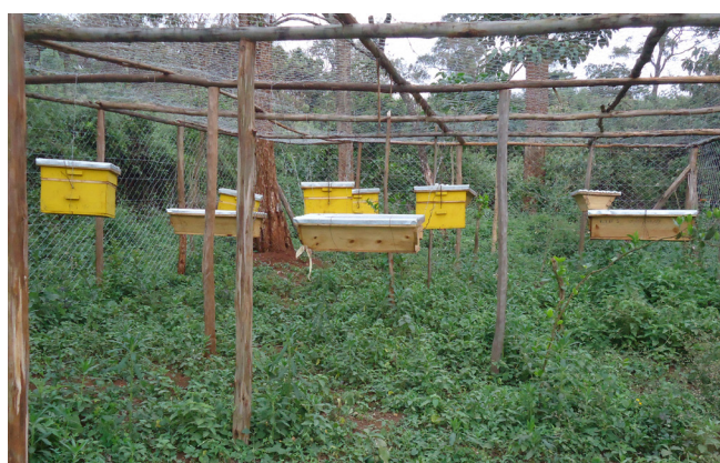
Beekeeping is one of the resource based activity that the community group aims to tap and enhance forest management