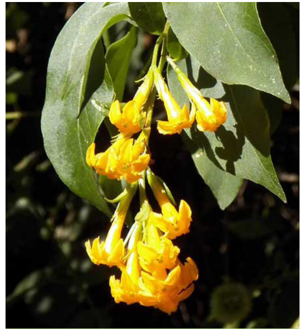
The invasive Cestrum sp. in its flowering stage

Community members and experts shared experiences and management options for Cestrum plant. The County government was asked to support the community in the management of this species. It was recommended that similar field days be held in all forest stations in Cherangani sub-county to sensitize more communities on management of C. aurantiacum . The guest of honour was the County Director of Environment and Natural Resources.