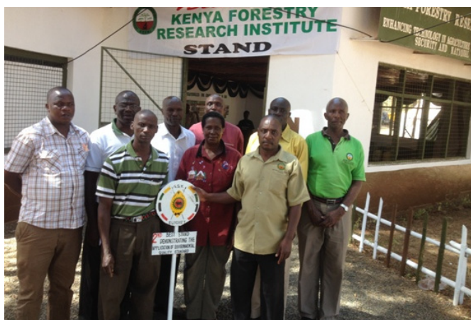
KEFRI staff holding a ranking board for attaining 2nd position for demonstrating application of EMS at Eldoret show