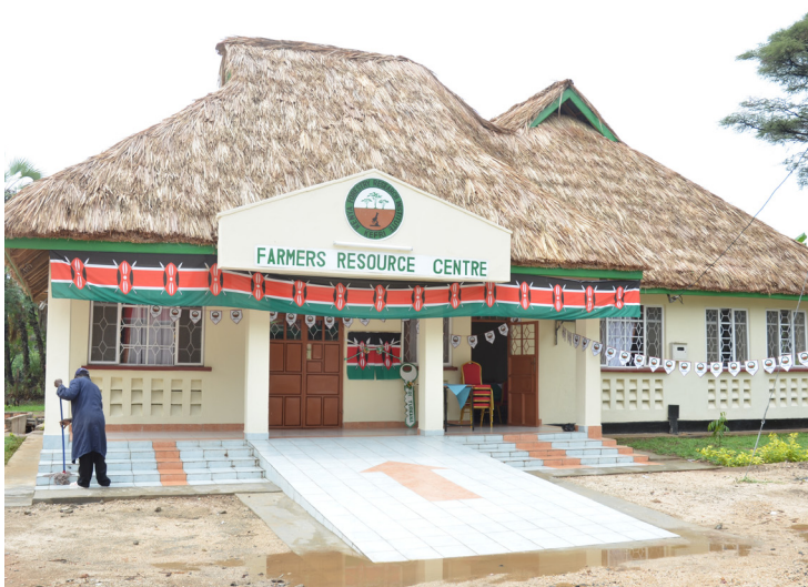
KEFRI Turkana Farmers Resource Centre