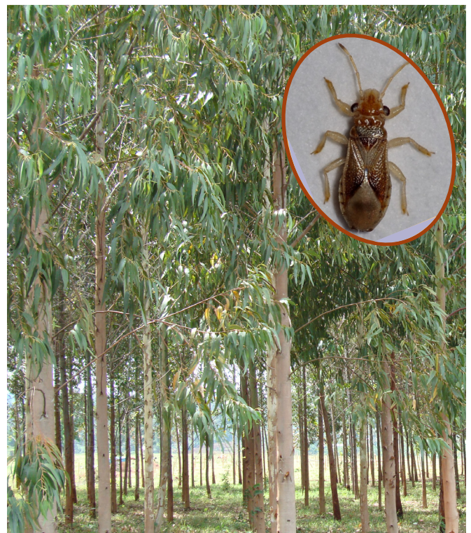
Thaumastocoris peregrinus (insert) on a healthy eucalyptus plantation

Since its invasion in Kenya, KEFRI has been working jointly with Forestry and Agriculture Biotechnology Institute (FABI) of South Africa in developing appropriate management strategies to mitigate economic loss. These