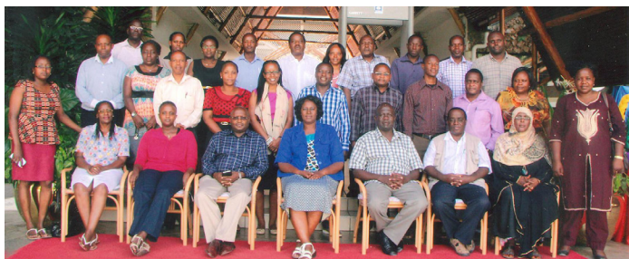
Participants from various institutions who attended the forum