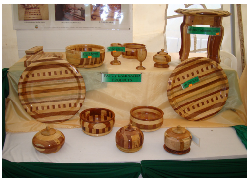
Assorted fancy items

Available products include; on-farm sawing and forest harvesting technologies, timber treatment and drying services, assorted timber and non-timber products, that links well to industry and small medium enterprises.