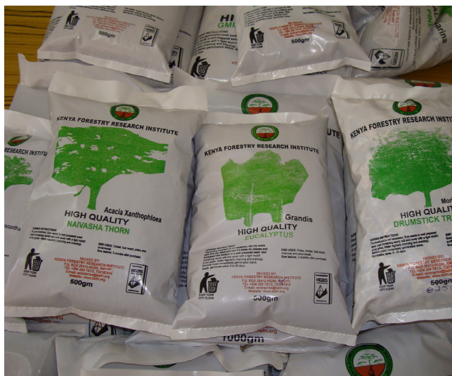
High quality packaged tree seeds ready for dispatch

K EFRI Enterprise Unit specializes in commercialization of the Institute's technologies, products and services. The unit is co-ordinated from KEFRI headquarters and has various revenue generating points Eco-region Research Programmes across the country.