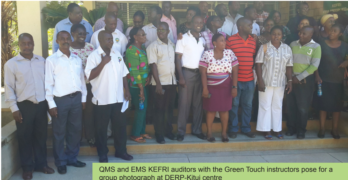
QMS and EMS KEFRI auditors with the Green Touch instructors pose for a group photograph at DERP-Kitui centre